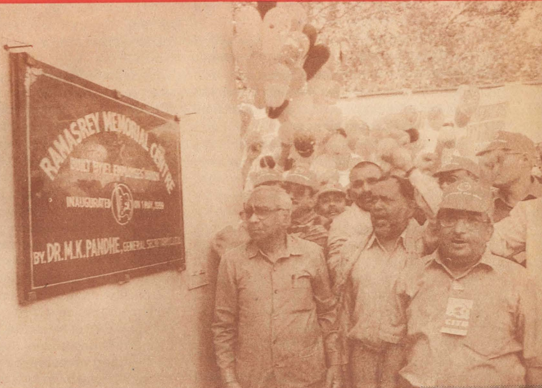
Ramasrey Memorial Declared Open