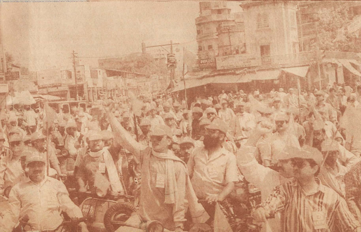
May Day Rally In Lucknow